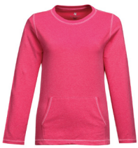
Heather Berry/Light Pink