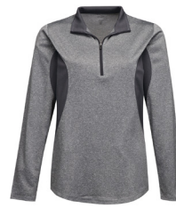
Deep Razz/Dark Gray