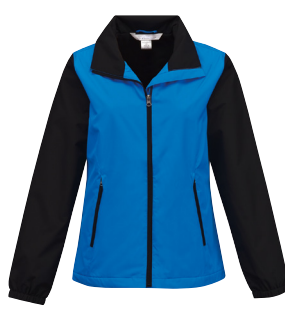
BRILLIANT BLUE/ BLACK